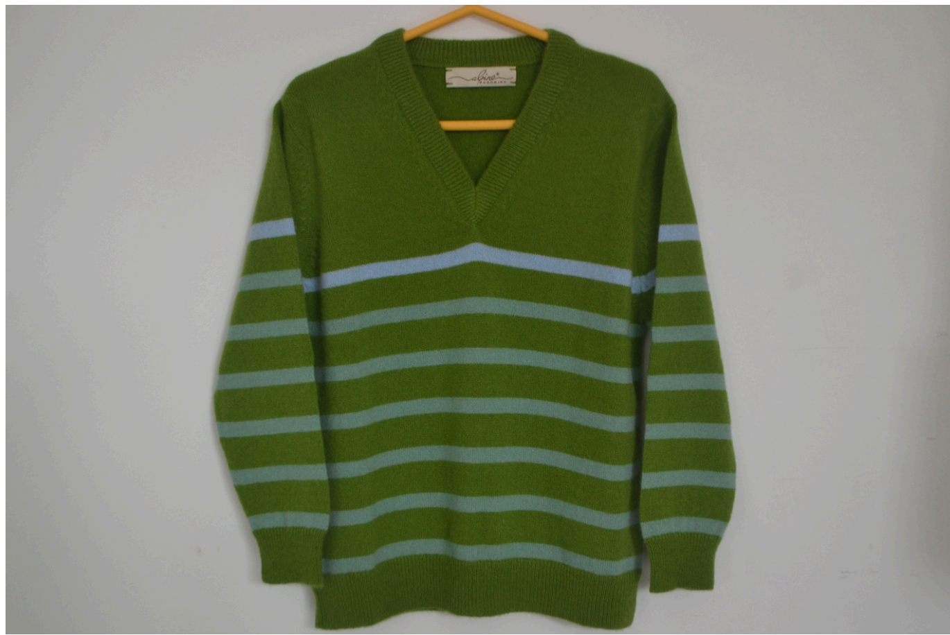
Striped Cashmere Sweater