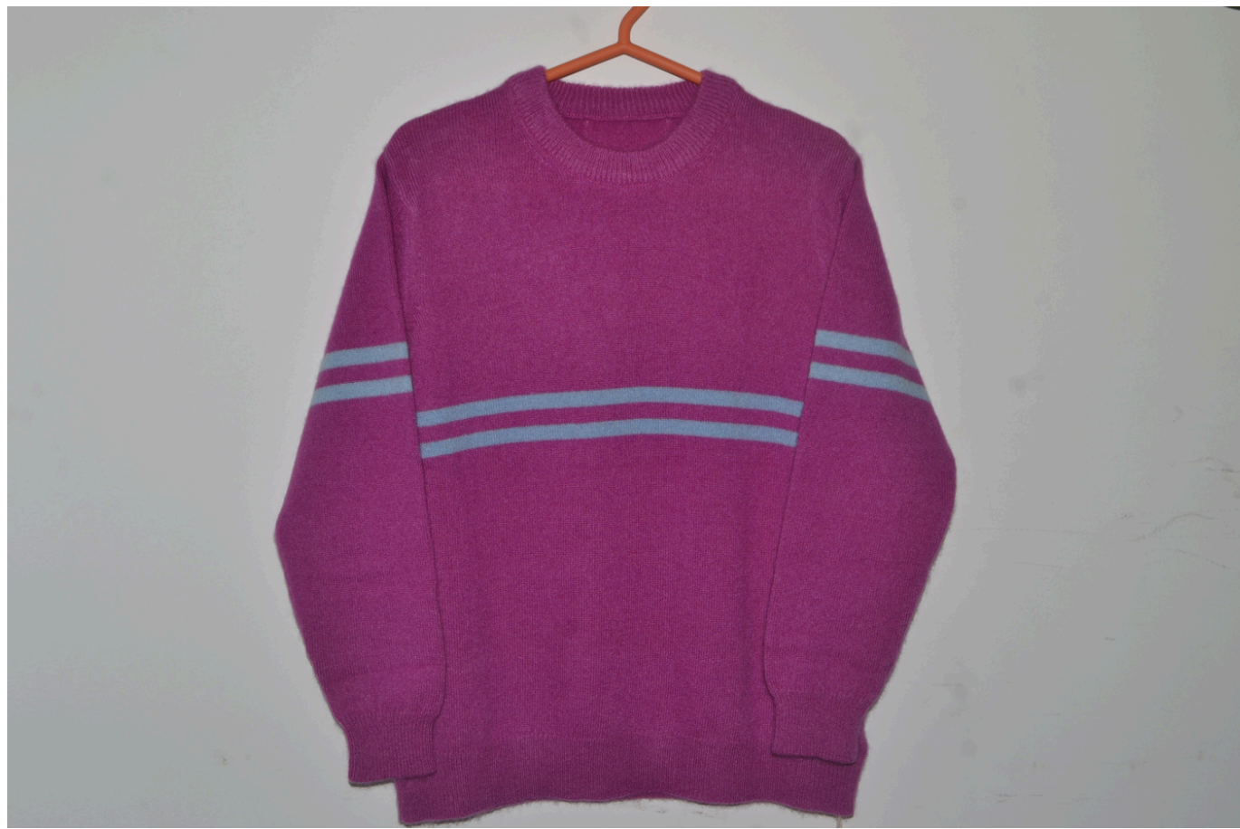
Dual Stripe Cashmere Sweater