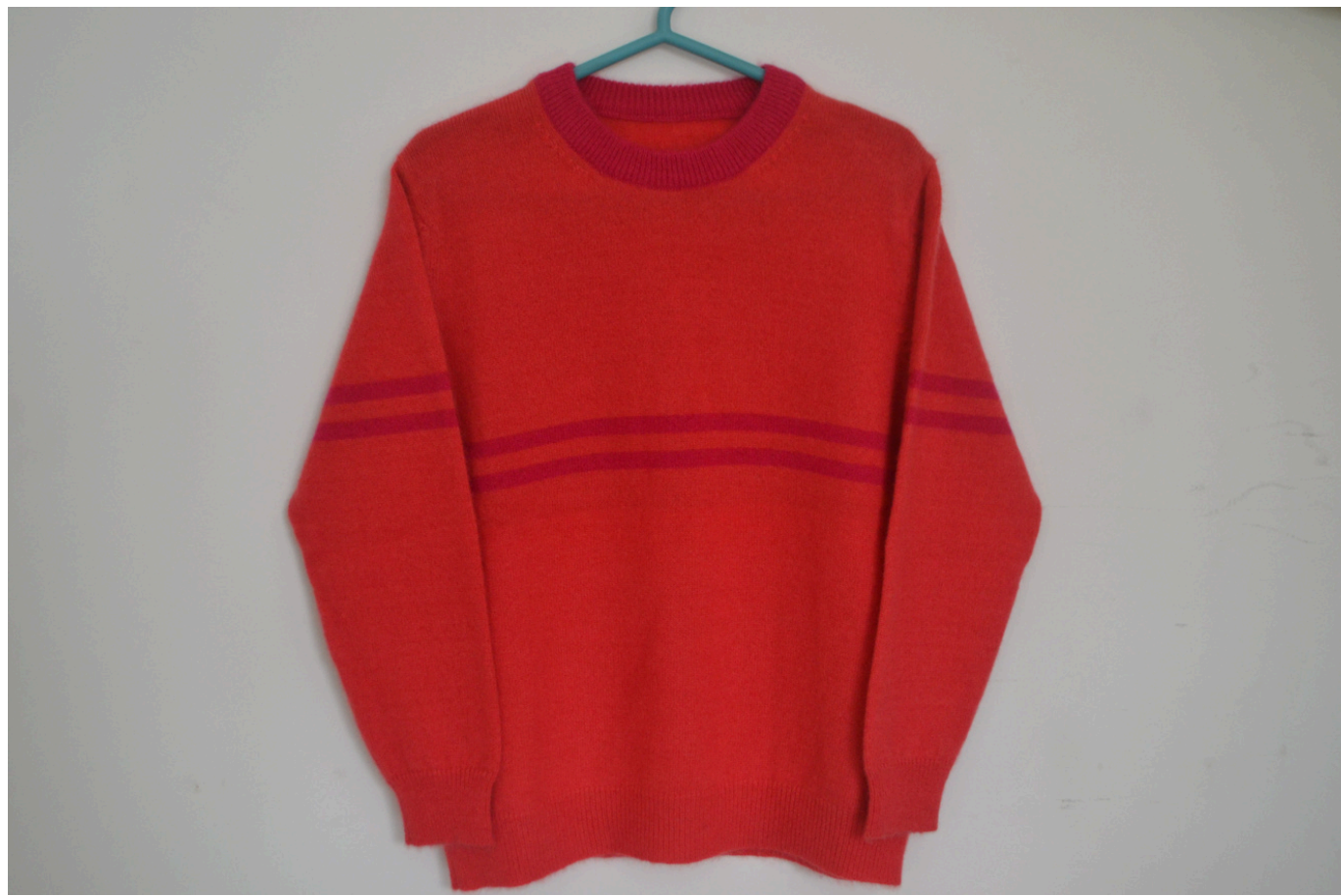
Crew Neck Cashmere Sweater